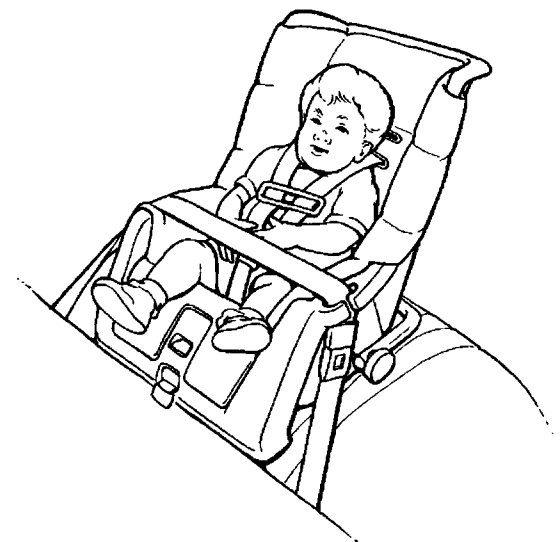
Picture 2 Rear-Facing Convertible Car Seat