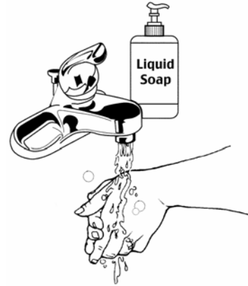
Picture 2 Wash your hands.

If you have any questions, please ask your doctor or nurse or call _____.