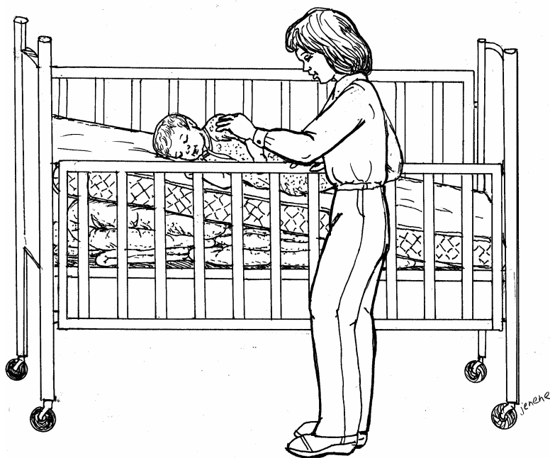
Picture 3 Raise the head of your child's bed by placing rolled blankets under the mattress.

If you have any questions, be sure to ask your doctor or nurse, or call _____.