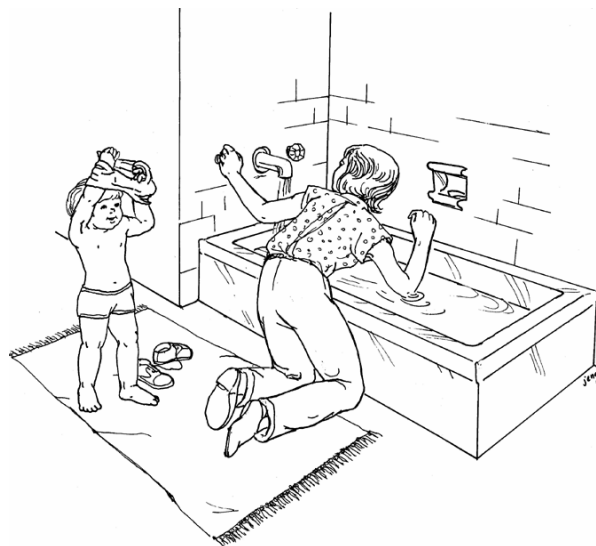
Picture 3 Never leave your child alone in the tub – even for a minute!