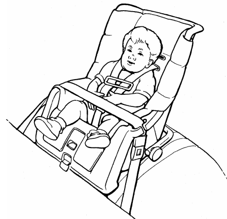
Picture 2 An approved car seat is the most important piece of equipment you can have.