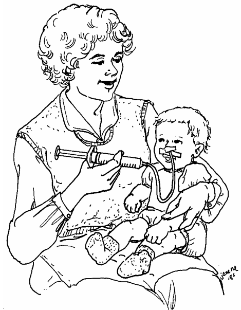
Picture 1 Having a hydrogen breath test.