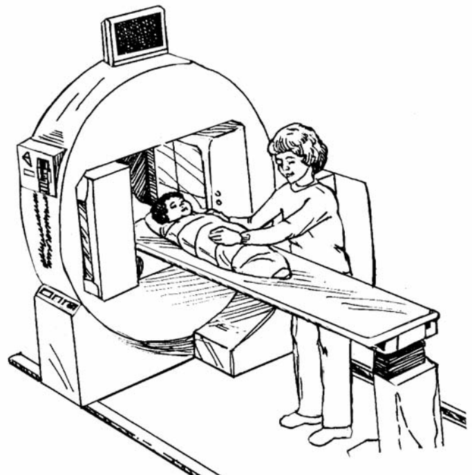
Picture 1 Having a renal scan.