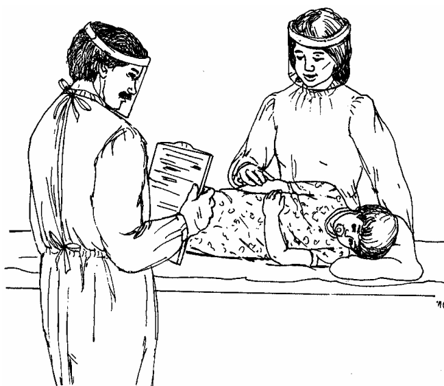
Picture 2 Ready to have an upper endoscopy.

If you have any questions or concerns, please ask your doctor or nurse, or call the GI Department at (614) 722-3450.