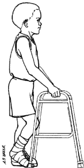
Picture 1 Stand tall. Move the walker forward so that the back legs of the walker are by your toes. Put all four legs of the walker down at the same time (don't “rock” the walker). If the walker has wheels, push the walker forward. Do not pick it up.